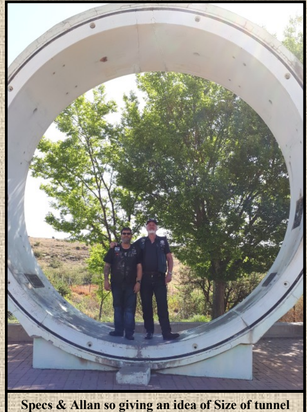
Specs & Allan so giving an idea of Size of tunnel

It comprises a system of several large dams and tunnels throughout Lesotho and delivers water to the Vaal River System in South Africa which in turn feeds Gauteng.