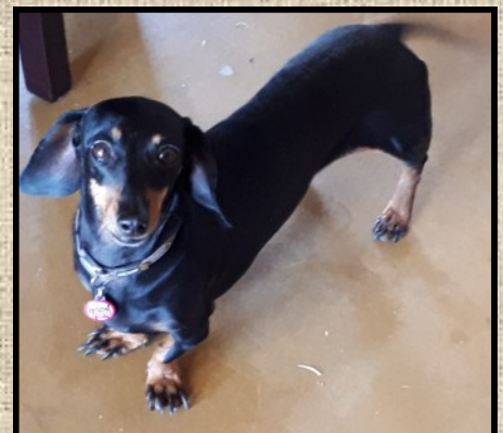
At the Cottage we had a daily visitor