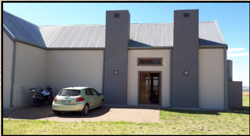
Specs, Hanelie, Trudie & Allan's home for the weekend.

The West Wits group was allotted a beautiful place called Clarens Country Cottages which was situated approx 2 kms out of town on the road to Bethlehem. Ok so it was a much more upmarket place but being in compensation for the extra travelling.