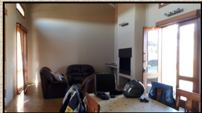
Kitchen, Dining room and Lounge a huge open plan