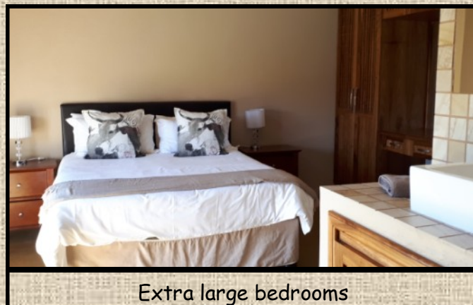
Extra large bedrooms

Spacious lounge with comfortable couches