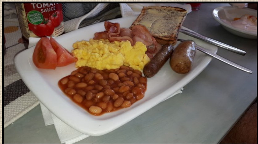
But one plate of Breakfast Feast - note Yoghurt on top right.

The breakfast buffet reminded us of Amanzingwe Lodge and was really tasty. Yoghurt and fruit was also enjoyed.